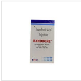
Ibandronic Acid Injection