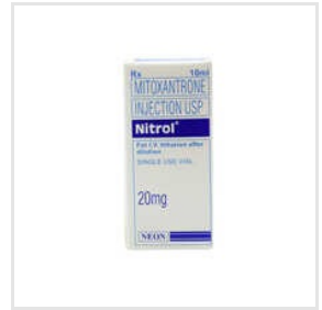
20mg Mitoxantrone Injection USP