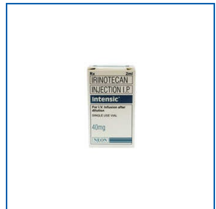
40MG 2ML IRINOTECAN INJECTION IP