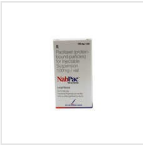
100 MG Paclitaxel For Injectable Suspension