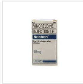
10mg Vinorelbine Injection IP