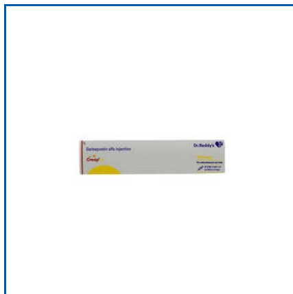
100MCG DARBEPOETIN ALFA INJECTION